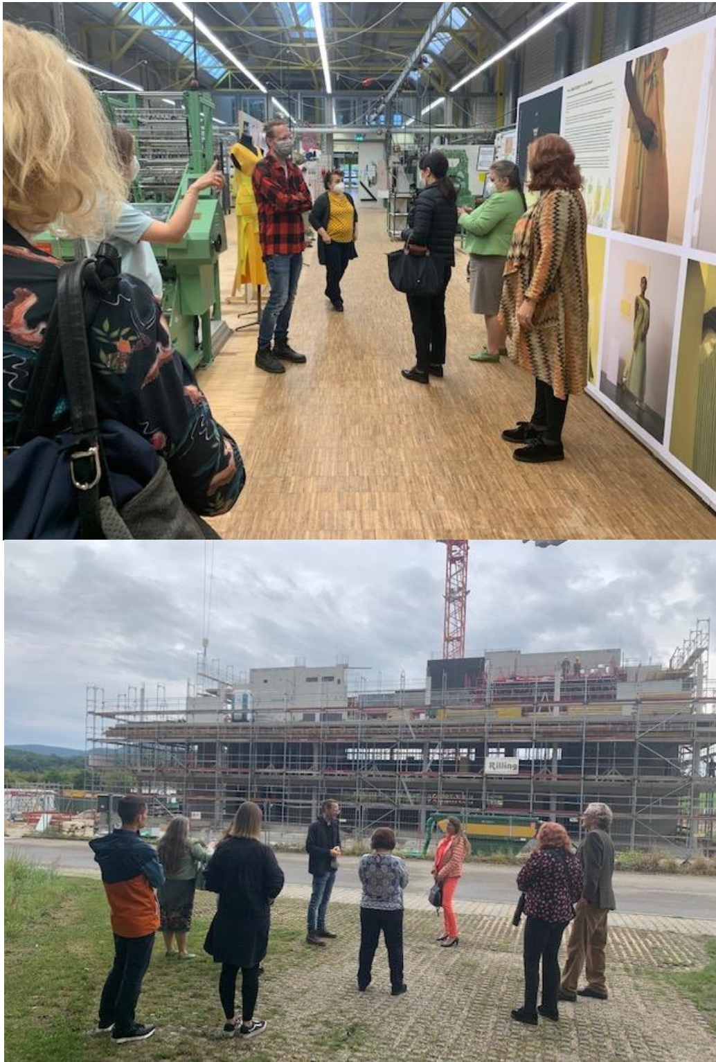
Figure 3 a, b: Visit of the textile laboratories (a) and the Texoversum construction site (b) at Reutlingen University

The meeting in Reutlingen ended with a discussion of open questions and upcoming tasks and responsibilities. All in all, it was another fruitful and joyful exchange. Now, the team is looking forward to meet hopefully again in person at the next Transnational Meeting in Yambol, Bulgaria in April 2022.