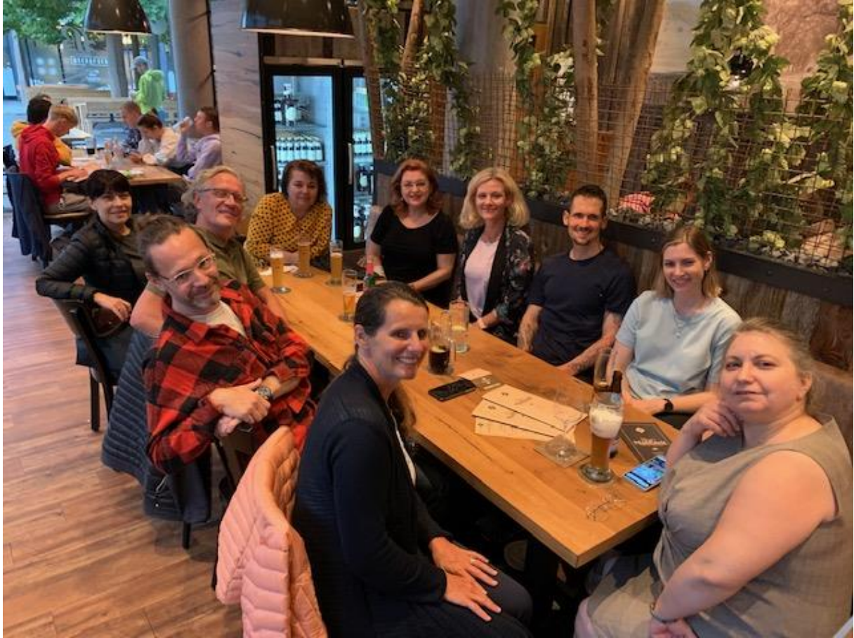
Figure 4: Get together at Reutlingen city